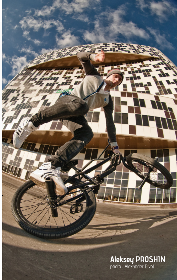
Alexander Bivol