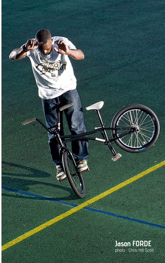
Jason FORDE photo · Chris Hill Scott

brakeless welded rim 36 holes rounded profile smooth, does not hurt hands St-Martin white nylon rim tape included (also available separately) 439 grams / 15.6 oz 2012 colors : black